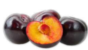
BLACK PLUMS 28 LB (3810)