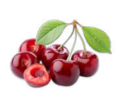
CHERRIES RED 16 LB (2922)