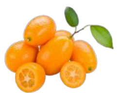
KUMQUATS 10 LB (3196)