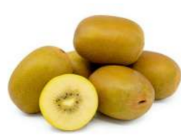
KIWI GOLDEN 33 CT (3174)