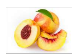
NECTARINES 18 LB (3464)