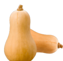
HONEYNUT SQUASH 20 LB (630)