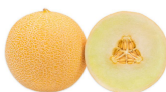
GALIA MELON 5/7 CT (3321)