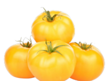
SUNGOLD TOMATO 12 CT (4182)