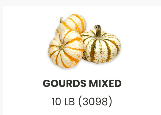
GOURDS MIXED 10 LB (3098)