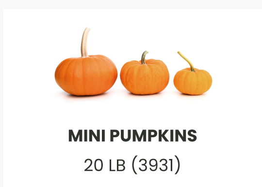
MINI PUMPKINS 20 LB (3931)