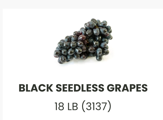
BLACK SEEDLESS GRAPES 18 LB (3137)