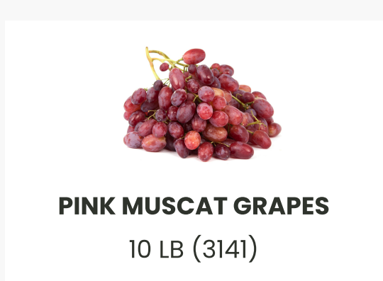
PINK MUSCAT GRAPES 10 LB (3141)