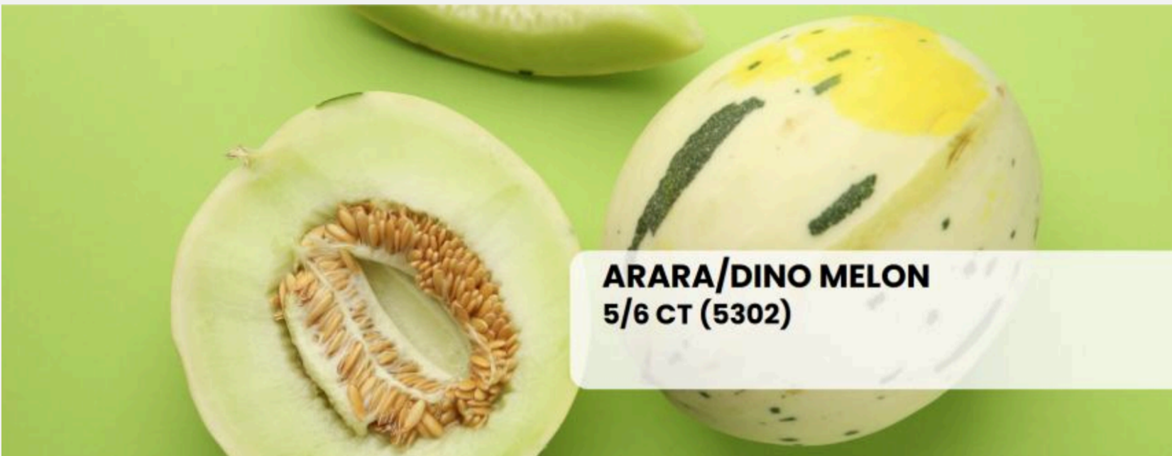
ARARA/DINO MELON 5/6 CT (5302)

Don't hesitate to contact your rep if you need further information.