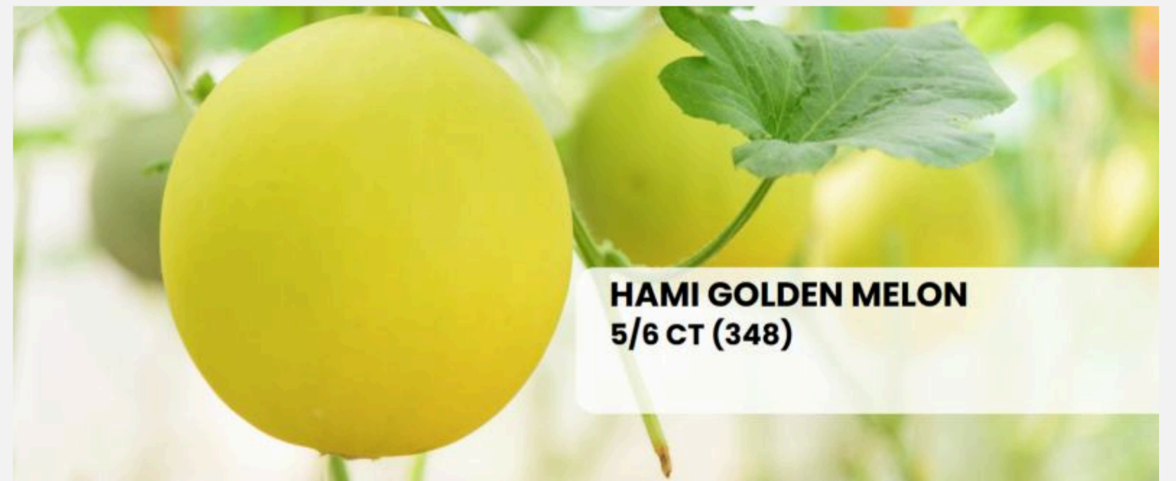
HAMI GOLDEN MELON 5/6 CT (348)