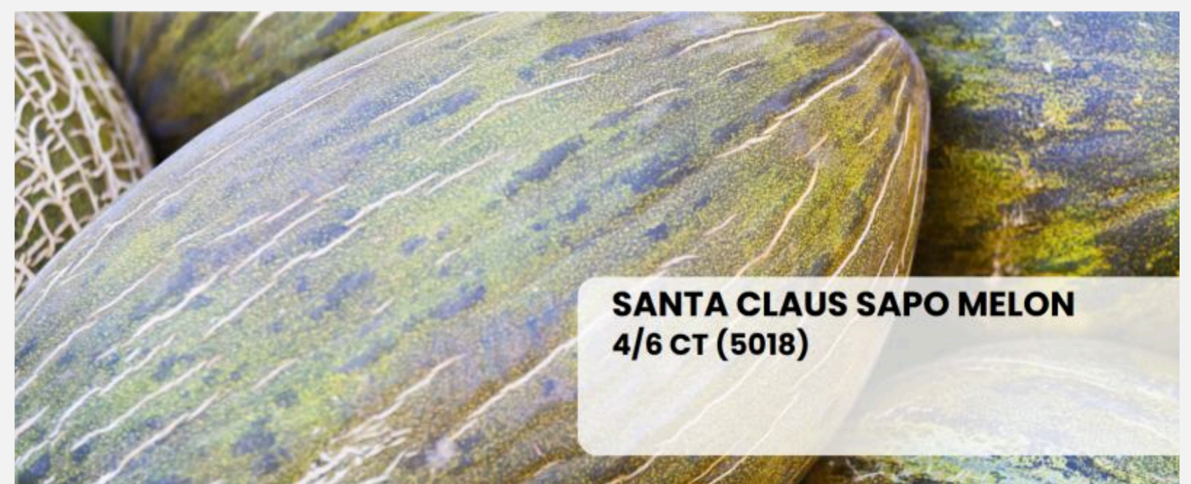
SANTA CLAUS SAPO MELON 4/6 CT (5018)