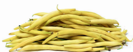
YELLOW WAX BEANS 25 LB (2732)