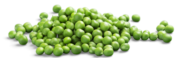
ENGLISH PEAS OUT OF SHELL 5 LB (3784)