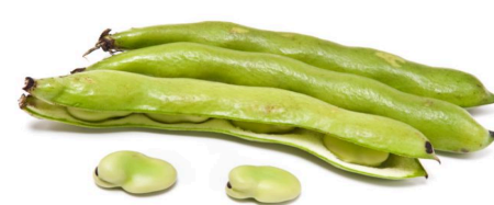
FAVA BEANS 25 LB (2715)